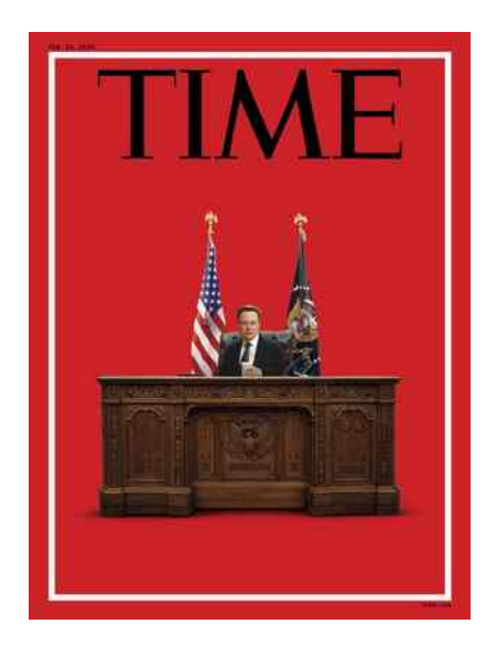
WHAT ARE THEY UP TO?

But it is the best option available. And in this era of data breaches, governmental turmoil and confusion, it offers some security and peace of mind.